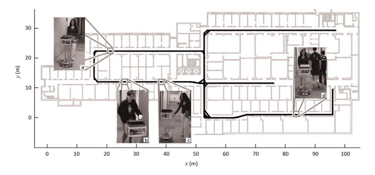
Figure 2: Trace of the path traversed by the robot while following the schedule. Snapshots: a) CoBots leads the visitor to her first meeting b) CoBot requests assistance with getting a cup of coffee c) The visitor graciously accepts her cup of coffee d) CoBot navigates around other humans in the corridor while leading the visitor to her last meeting

We report uncertainty in terms of D(\mathbb{P}^*) in cm, although Policy Uncertainty was also used to calculate when to ask. We set t_{unc} to 200cm for the decision algorithms that require it, and note that higher thresholds would result in fewer questions and lower thresholds results in more frequent questions. While the threshold would change the frequency of questions, the proportion of questions between conditions would be impacted uniformly.